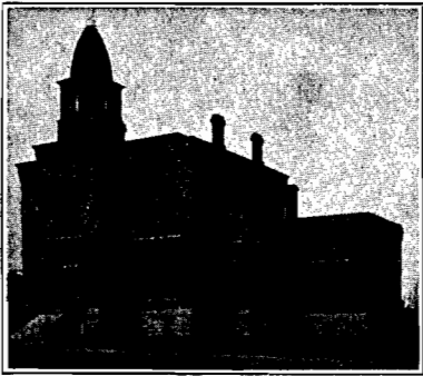
OFFICE IN CITY HALL